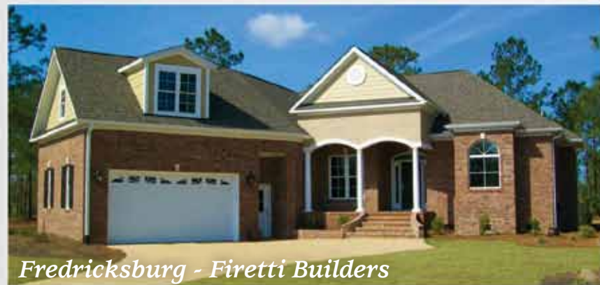
Fredricksburg - Firetti Builders