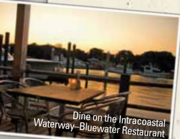
Dine on the Intracoastal Waterway—Bluewater Restaurant

If you're craving some fresh local catch, then look no further...the Intracoastal Waterway is lined with great cuisine! Whether it's lunch on a sunny day or dinner under the stars, what better way to enjoy your meal than taking in the beautiful sights of the North Carolina coast. Have a boat? Dock it at one of the many restaurants and enjoy a bite before heading back on the water!