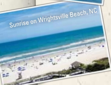
Wrightsville Beach

The North Carolina coast is known for its beautiful pristine sandy beaches. And enjoying them is just a quick 20 minute drive from our gates. Head over to Wrightsville Beach and enjoy some coastal cuisine, take in the sights at the famous walking "loop" or soak up some rays in the sand.