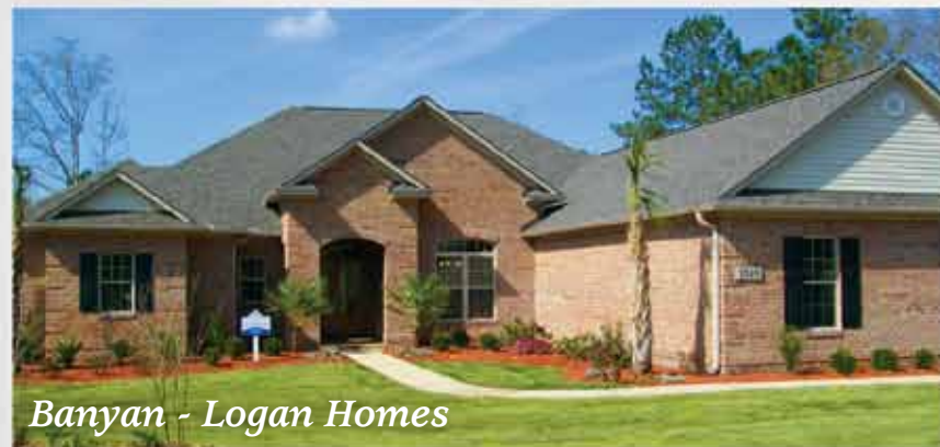
Banyan - Logan Homes