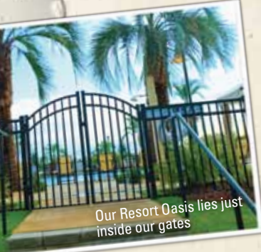
Our Resort Oasis lies just inside our gates

With the opening of our Resort Oasis and Grand Lanai, you'll want to spend your summer days lounging by the pool or gathering with friends! At Compass Pointe, we offer resort-style living, right outside your door. Relax poolside or fire up the grill with friends at the Grand Lanai—is there anything better than that?