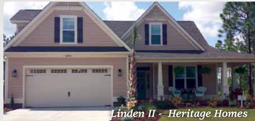
Linden II - Heritage Homes

HOMES FROM THE $200s- THE $550s+ HOMESITES FROM THE $50s- THE $150s+