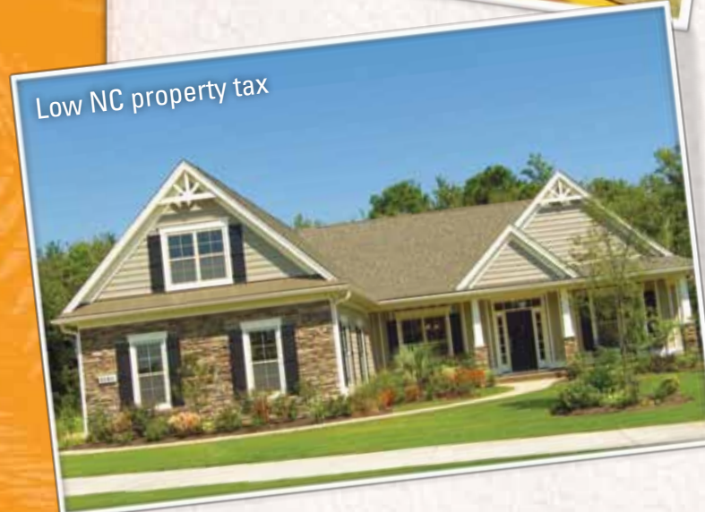
Low NC property tax