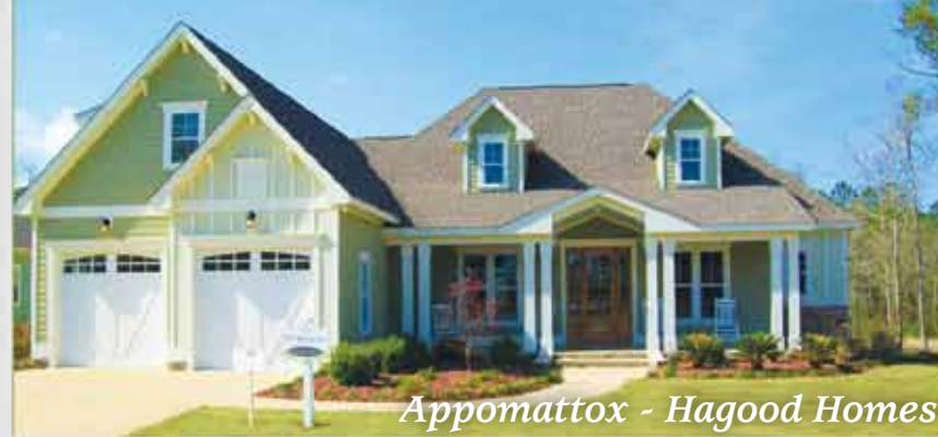
Appomattox - Hagood Homes