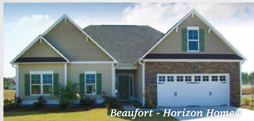
Beaufort - Horizon Homes