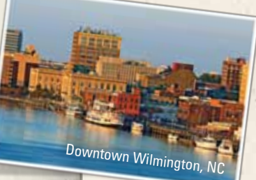
Downtown Wilmington, NC

Head to the riverwalk in downtown Wilmington every Friday evening for a free concert as the sun sets over the river. Enjoy live music and, as an added bonus, beer, wine and food abound!