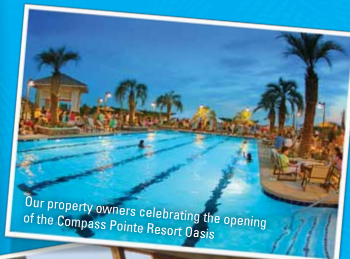
Our property owners celebrating the opening of the Compass Pointe Resort Oasis

Let's keep those fantastic referrals coming! If you know someone who you think would like to receive more information about our beautiful community, we've made it easy for you to share their name with us. Visit us at CompassPointeNC.com/share to refer a friend or call us at 888.717.6468 and provide us with their contact information. We will forward along a Compass Pointe informational packet along with your best wishes.