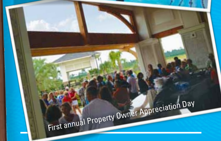
First annual Property Owner Appreciation Day

Visit CompassPointeNC.com/share to submit your referral!